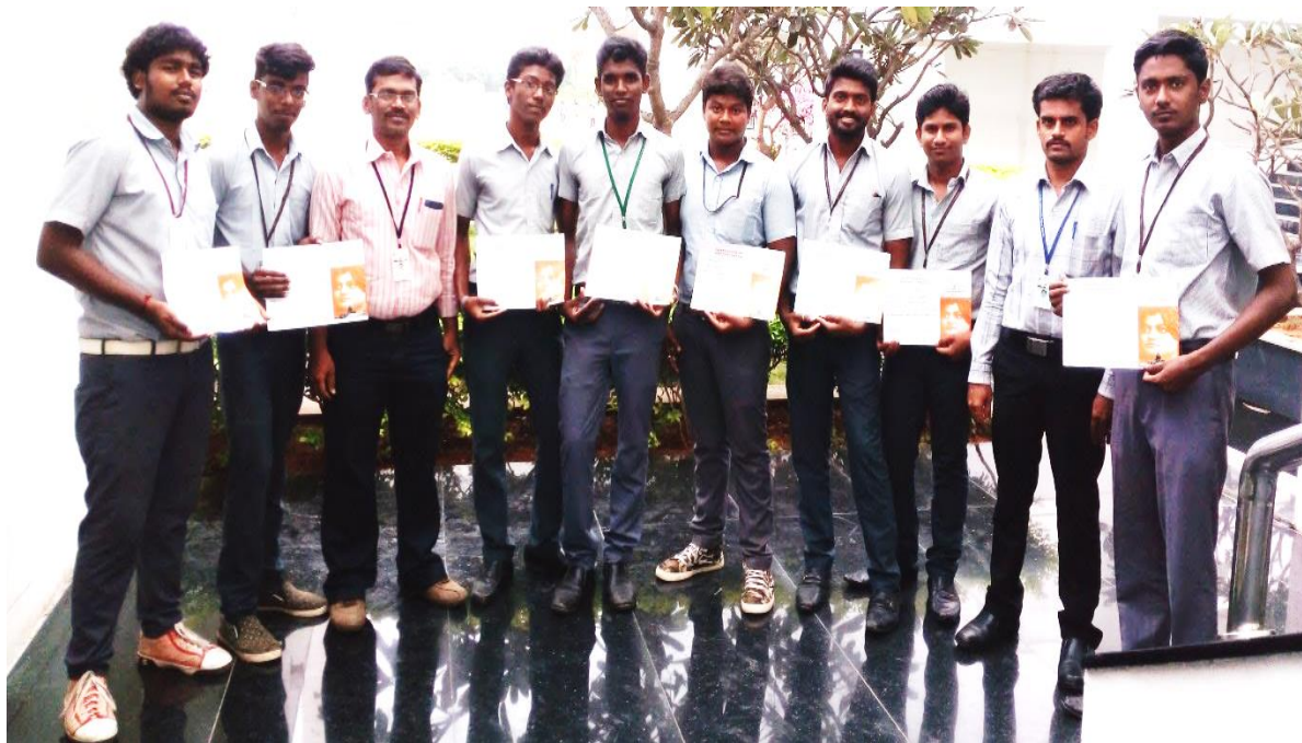
(Second Prize in MIME - State Level National Youth Day Competitions held in Kanniyakumari)