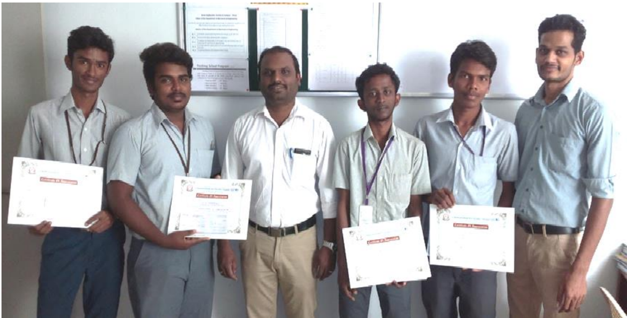
(Second Prize in Paper Presentation – State Level Technical Symposium held in Thangapazham Polytechnic College)