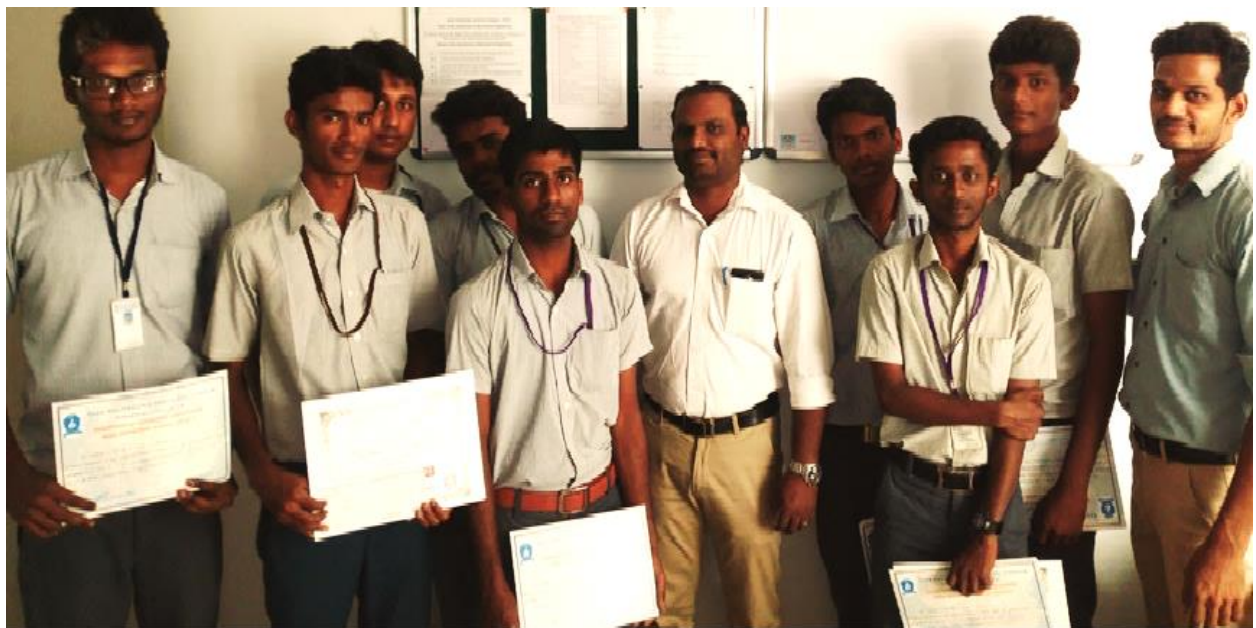
(Winners in Paper Presentation, Quiz and Connecting Slides)